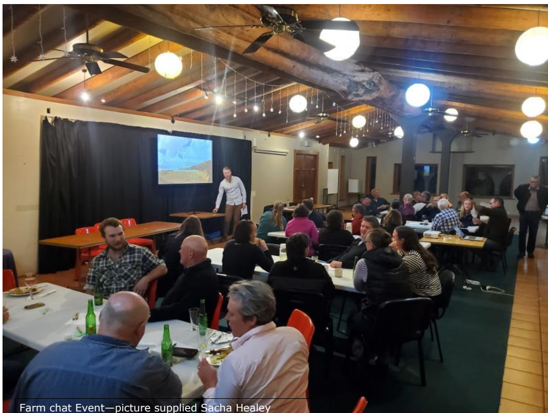
Farm chat Event

done first and the resource consent pathways where that is a possibility. She clarified that synthetic nitrogen levels are a case of being able to prove that higher amounts are not having a bad effect on waterways.