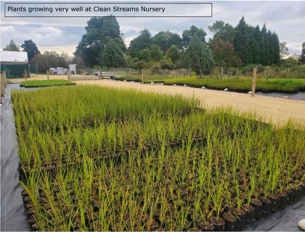
Plants growing very well at Clean Streams Nursery

Building on these ideas, Clean Streams Karamea will host an action-based catchment care workshop in June, aiming to identify exactly what farmers and landowners in the district might be able to get help with, and setting up the first steps.